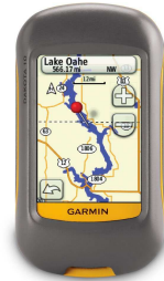
Figure 3: QENP GPS Model

Following participation in the game and concluding the demonstration, audience members will be able to interact with a model of GPS (Fig: 3) that is currently in use in QENP. Here, we will demonstrate how generated patrol strategies will be displayed on a GPS for rangers to use in the field.