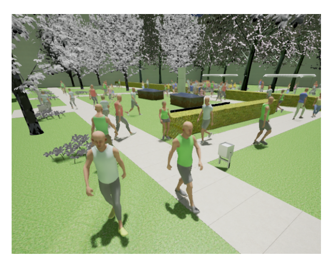
Figure 1: Example of a MISER configuration setup with virtual background agents evolving in an open-space virtual world.

Copyright © 2017, International Foundation for Autonomous Agents and Multiagent Systems (www.ifaamas.org). All rights reserved.