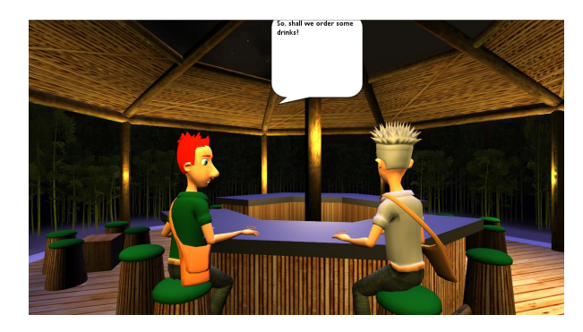
Figure 1: Small talk in the Bar

In the playable demonstration, there is currently one country, named Malahide, with two Critical Incidents. The first one takes place in a bar (see Figure 1) where the user needs to get directions to his hotel and the second one occurs in a museum where the user needs to ask a park supervisor for his permission to enter a park. The behaviour of the characters emerges from their ascribed cultural parametrisation. This allows the scenarios to be replayed with the user dealing with multiple cultures in similar situations.