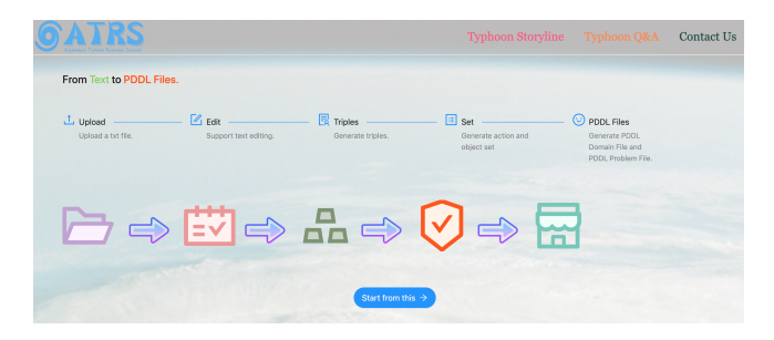
Figure 2: Web-based autonomous typhoon response system (ATRS) provides an automatic generation of typhoon contingency plan through the PDDL model learning framework.

In addition, we provide the comparison between our techniques and the latest domain model learning methods that is used for the purpose of generating a storyline [5]. The users can choose either of them to learn the domain model and expect similar interactions to refine the learned outputs. In the current format, our new framework has better performance than others, and can deal with general text inputs. We intend to accommodate more PDDL model learning techniques in the future, and improve all the ATRS functionalities to publish the external link for a general use. The link of our demonstration video could be found below [16]. We add elaborative text at the bottom of every screen in the video.