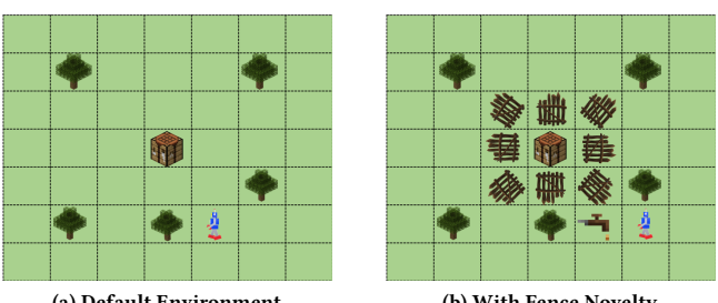
(a) Default Environment