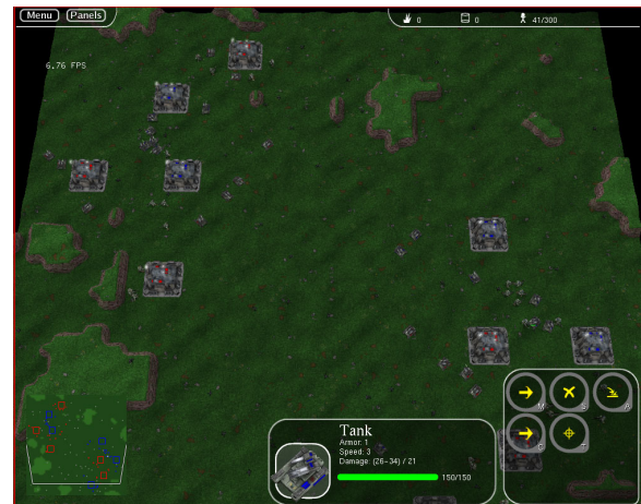
Figure 1: The 3D view of the ORTS Tankbattle game.

Copyright © 2008, International Foundation for Autonomous Agents and Multiagent Systems (www.ifaamas.org). All rights reserved.