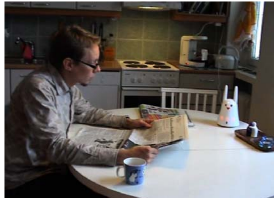
Figure 1: The Nabaztag™ device