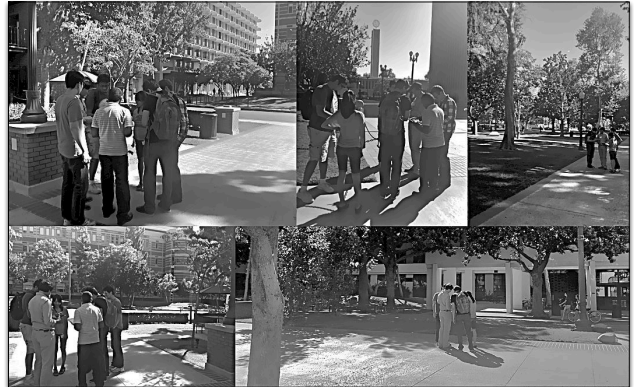
Figure 4: A Team-It game on the USC campus showing players coordinating to complete tasks.

We will bring several iPads on which participants will be able to use TEAM-IT. We will adapt the location-based services to work indoors by using one of two features: step-based tracking using the accelerometer where participants can physically move or accelerometer-controlled motion where participants move by manipulating the iPad. We will choose the best option based on the location and structure of the demo facility. The TEAM-IT demo will involve participants joining teams and working with their team, other teams and software agents to complete tasks and gain points. We will display a live scoreboard of the best performing teams. Participants will be able to join and leave the game at any time. A movie of TEAM-IT can be found at: http://youtube.com/ .