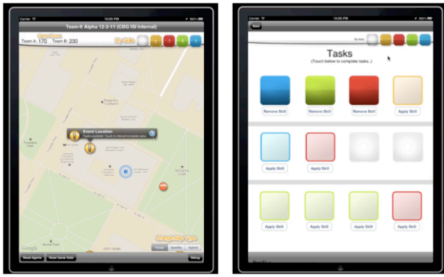
Figure 2: Players can see tasks as yellow circles that show an exclamation point when the player is within the discovery radius (left figure). At the top right, players can see their card sets. By pressing the task collection icon, players go to the card application interface (right figure) where they can apply cards to a chosen task.

points which can differ by team. The points received are known when the task collection is discovered. Figure 2 shows tasks in the map interface as well as the card application interface.