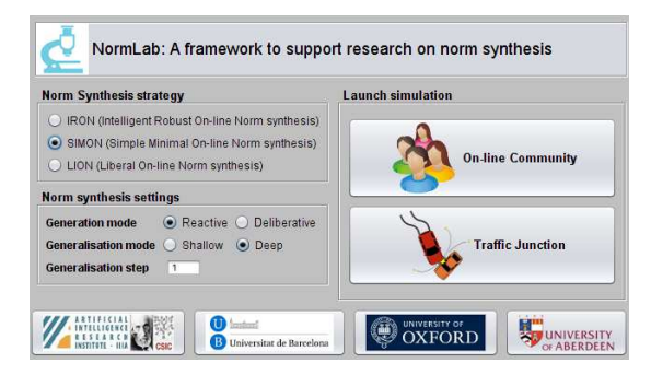
Figure 1: NORMLAB's initial menu.

Appears in: Proceedings of the 14th International Conference on Autonomous Agents and Multiagent Systems (AAMAS 2015), Bordini, Elkind, Weiss, Yolum (eds.), May 4–8, 2015, Istanbul, Turkey. Copyright © 2015, International Foundation for Autonomous Agents and Multiagent Systems (www.ifaamas.org). All rights reserved.