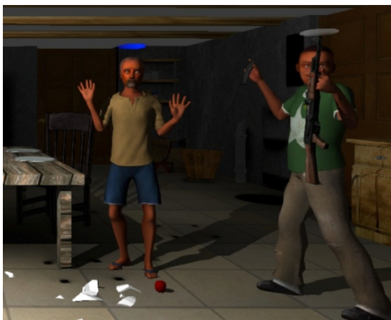
Figure 1. A snapshot from Breaking Bread

Breaking Bread presents the player with a social puzzle. She wants to complete her house search mission, achieve cooperation from the civilians in the house (rather than resistance), and assist the LNS, who is supposed to lead the search but is unfortunately badge-heavy. If the player takes no action, due either to inattention or failure to understand the social conventions, the scenario plays out as follows: The head of the household (HoH), a middle-aged man who speaks no English, warily allows the player and LNS into his home and gives a greeting of a small bowl. He offers a bowl of fruit to the player and is offended when the gift is not accepted. The LNS begins wandering around the house and