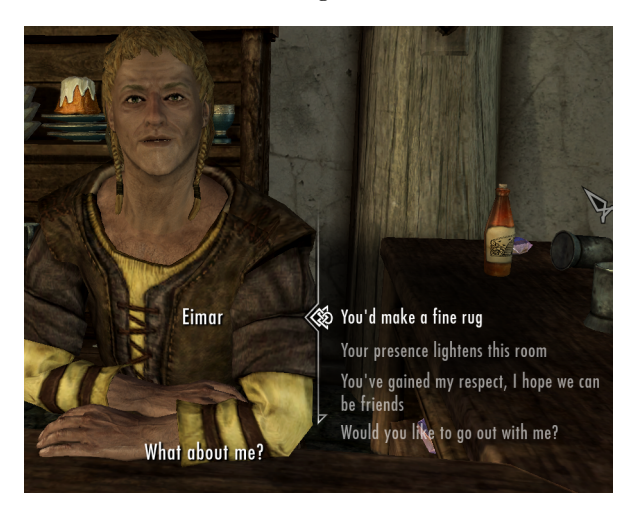
Figure 2: Some of the new dialog options available with the mod

is to "mimic" the actions that NPCs perform towards other NPCs and give the Player the option to perform some of those Social Moves. All of the performed Social Exchanges have a response. The NPC can either accept or reject any one of these "moves" according to their Beliefs and Desires.